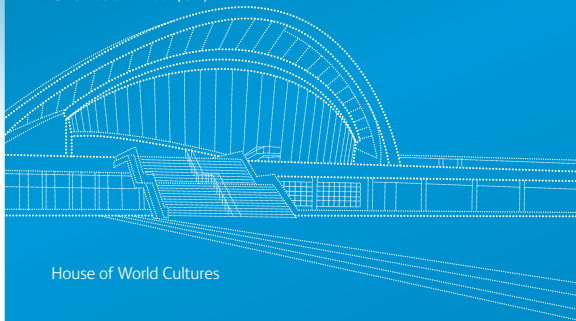
House of World Cultures